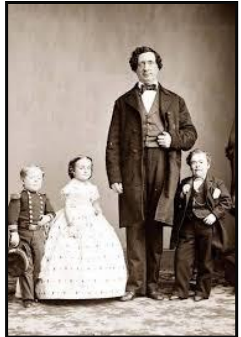
Commodore Nutt, Mrs. Lavinia Stratton, Unknown man, and Mr. Charles Stratton a.k.a. “Tom Thumb”