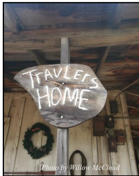
A replica of the original sign now hangs on the front porch with its original spelling! Skip thinks that the house stood out so strongly on the western prairie that many people stopped by looking for room and board..

United States and in foreign countries, including Australia, Canada, England and Japan.