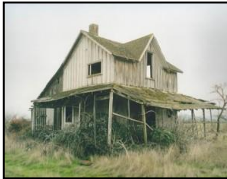
The Wood House in disrepair in 2000.

After Walter Wood passed away in September of 1974, the house was boarded up and abandoned. An investor from California purchased the house and the 38 acres it sat on in 1983. The house continued to waste away and it was taken over by brush, blackberry bushes and vandals. Due to its deteriorated condition and the backdrop of Mt. McLoughlin, the Wood House became the most photographed and art painted house in the Pacific Northwest, and it still claims that title today. There are photographs and paintings of the house all over the