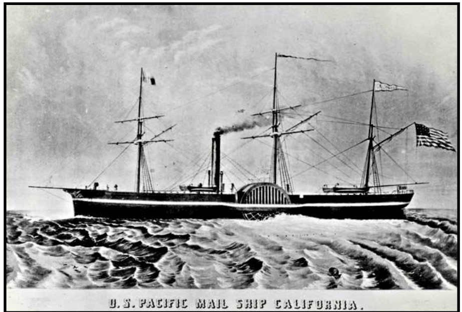
SS California , the first ship of the Pacific Mail Steamship Company. This side paddle steamship was used between Panama and San Francisco between 1848 and 1894, when she was wrecked off the coast of Peru.

The isthmus had long been valued as a possible short route from the Atlantic to the Pacific Ocean ever since Vasco Núñez de Balboa first sailed by its shores in 1503 and wondered what was out there. Once Balboa learned from the native peoples that there was a great expanse of water and much gold to be found on the other side, he and his crew of Spanish sailors started hacking a path through the rugged jungle. Despite unstable swampy jungle conditions alternating with rocky rugged terrain, and accompanied by torrential rain, tropical heat, and disease causing insects carrying malaria and other illnesses (the connection as yet not understood), they were successful by 1513. Balboa and his men then had to struggle back to their ships on the east coast, not being able to take advantage of