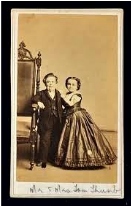
Mr. and Mrs. Charles Stratton better known as Mr. and Mrs. Tom Thumb