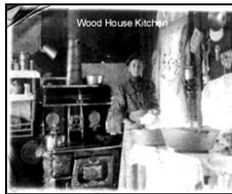
Original photo of the Wood House kitchen, taken in about 1900.