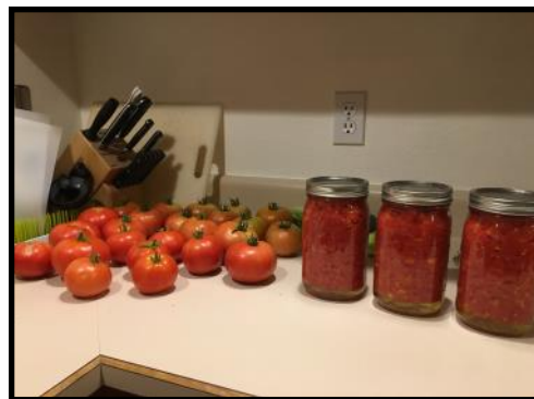
The winning picture