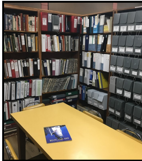
The Research Library at the THS Museum.

This period during the early 2000's was also when Talent, along with all the