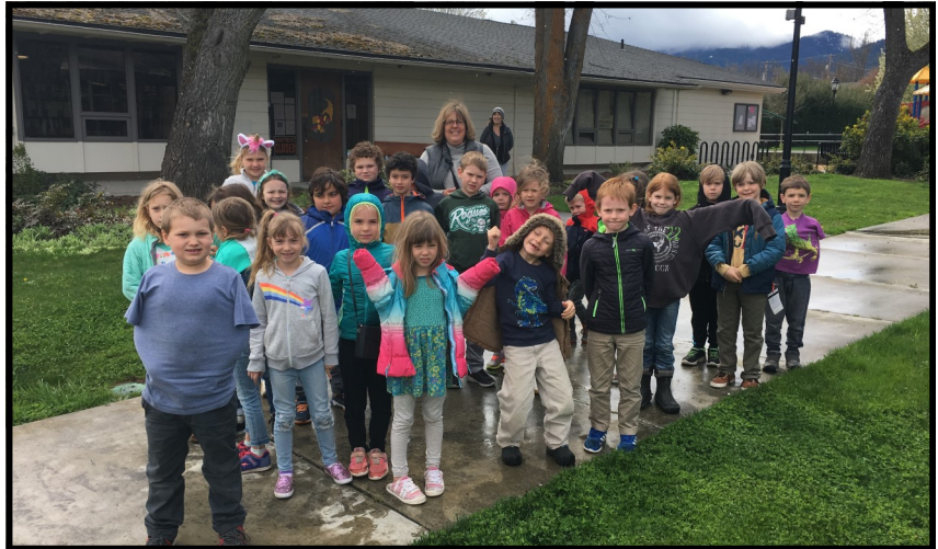
One of the groups of Talent Elementary students visiting the museum

The groups changed places and tour guides after about 45 minutes in each place. The children infused the historical places with vitality as they learned about