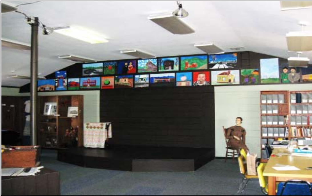
Colorful display of paintings above the stage at THS