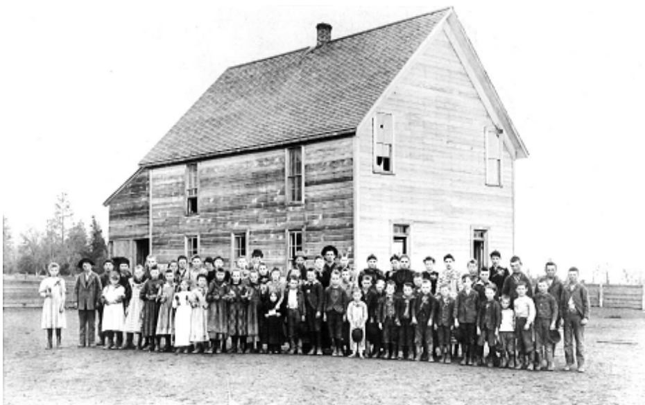
North Wagner Creek Schoolhouse, late 1880s. No bell showing in this picture but there is a chimney!