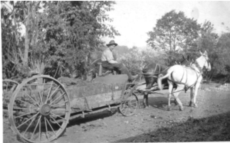
Manure spreader in Talent - Patterson family