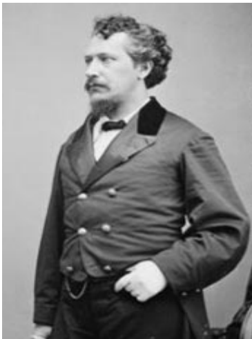
Photo from Google image search of Geroge Francis Train (1829-1904)